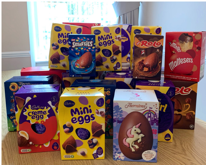
Photograph of Easter Egg Donation, above

Donations like this is a further example of the positive working relationships we have with Partick Job Centre and make a big difference to our service.