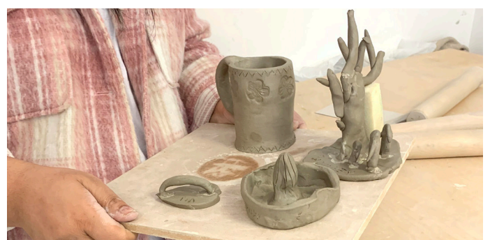
Photographs from Pottery Workshop, above.