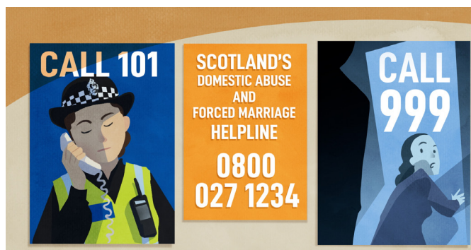
Still from Animation, above.